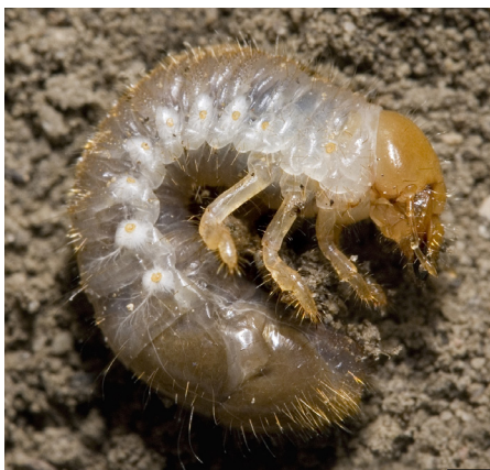
Figure 3. Japanese beetle grub.