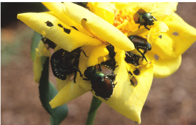
Figure 6. Rose flowers damaged by Japanese beetle adults.

It's easy to identify defoliation caused by Japanese beetles (Figures 5 and 6). So that the worst damage is prevented, start checking for beetles early in the season before damage symptoms appear. Regular scouting for adults and grubs should be conducted starting in early spring. Using beetle traps is a good way to monitor populations, but traps have not been shown to be effective at reducing populations or feeding damage on plants. Japanese beetle traps use pheromones and floral lures to attract both males and females. The clumsy flight of the beetles causes them to be caught up in the trap. Larvae can be sampled in late spring (April) to late summer (September). Checking underneath pale brown or discolored areas in lawns or turf, or among roots of unusually wilting plants, will reveal grubs (Figure 7). Ten to 12 grubs within an area of 1 square foot warrants treatment, although the wetness of the soil influences larval infestation.