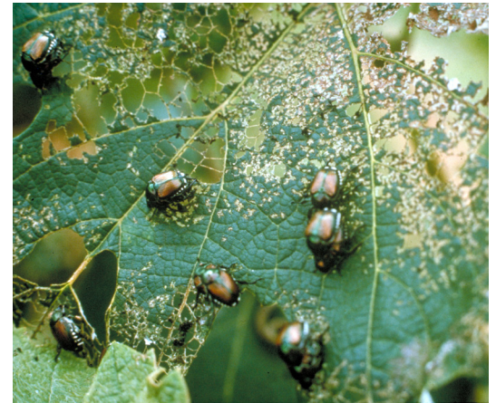
Figure 5. Skeletonization of foliage caused by Japanese beetle adult.

The most visible symptom of Japanese beetle damage is skeletonization of the foliage (Figure 5), which occurs when the beetles consume the leaf lamina, leaving a skeleton of the veins intact. Japanese beetles also destroy flowers and fruit, and during population peaks, they can defoliate entire trees. The adult beetles usually begin feeding on the topmost, youngest leaves of a plant irrespective of its height, and they are most active during the day from midmorning to early evening. Larval feeding on roots leads to symptoms resembling drought stress, and patches of wilting, discolored, or dying plants or turf can be seen. These small patches gradually expand, and when the roots of such plants are examined, grubs can be seen. Grubs are also sought by birds and larger animals like raccoons and armadillos that add to the destruction when they dig for grubs.