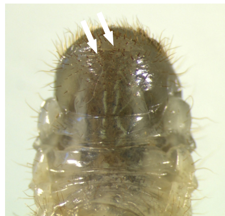
Figure 4. Japanese beetle grub pattern of hairs on raster (white arrows).