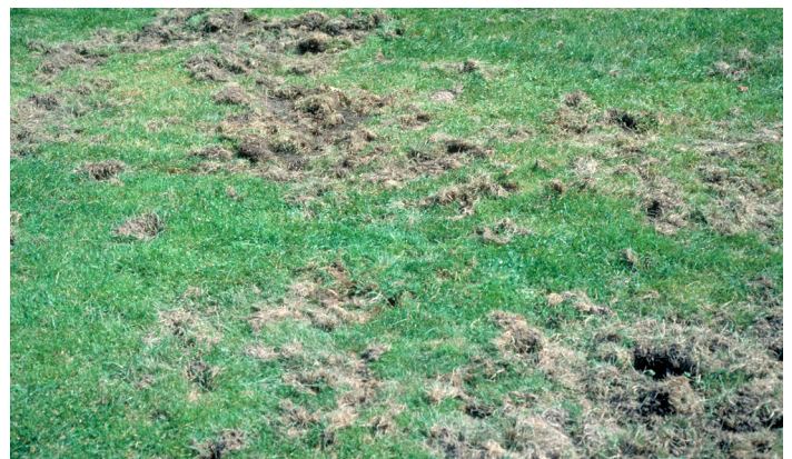
Figure 7. Turf damaged by Japanese beetle larvae.