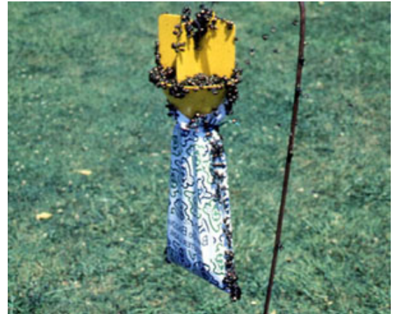
Figure 8. Japanese beetle trap.

Chemical control often becomes necessary in managing this pest. Choosing pesticides should be done after assessing the situation and the risks and benefits associated with their use. Short residual insecticides sprayed on foliage and flowers effectively manage the adults, as do commonly available systemics. Longer-persistence insecticides applied to the soil in early summer are good for the preventive control of grubs. Choose insecticides labeled for use against Japanese beetles and for application on the host plant referring to the most current version of the Georgia Pest Management Handbook. Your local University of Georgia Cooperative Extension county office can help with specific recommendations. Follow all directions, particularly safety precautions on the insecticide label.